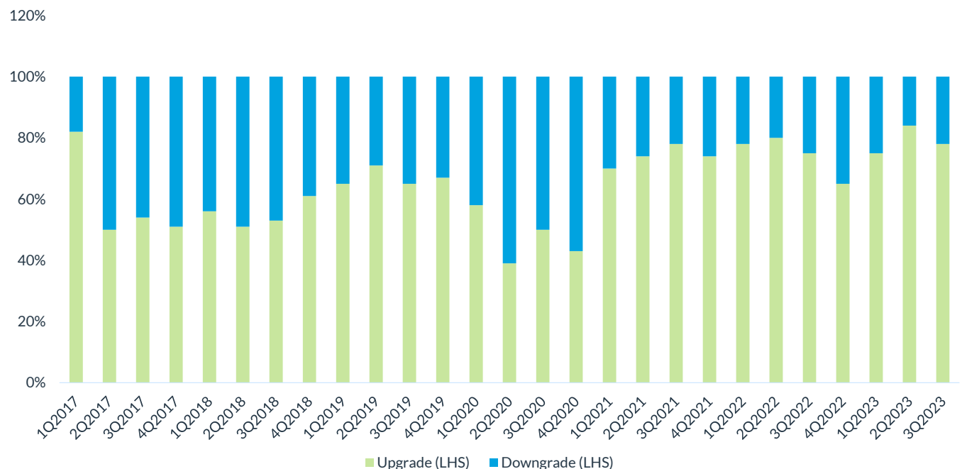
Moody's Upgrade vs. Downgrade Ratio on a Positive Trend Since the Pandemic

Published credit ratings are the market standard for evaluating the risk of a particular issuer. While we apply a proprietary approach to credit assessment, credit ratings influence market valuations and liquidity. Since 2021, the quarterly trend of the ratio of upgraded issuers versus those downgraded has been positive, according to Moody's. The data shows only two negative quarters (i.e., more downgraded issuers than those upgraded) since 2017. The flow of direct and indirect federal pandemic aid bolstered issuer recovery over the past three years, helping propel the wider margin of upgrades relative to downgrades. However, a deceleration in the economy will likely to slow the pace of upgrades, but credit quality remain mostly stable across core